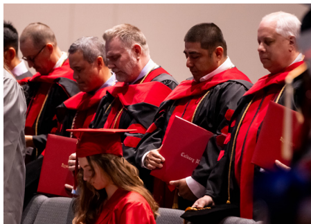
Graduates pray together during 2025 Commencement.

Several strengths of the program are the diversity of the teaching faculty, the “cohort” system, and that it has no residency requirement; the program can be completed 100-percent online without having to move to Kansas City. In the development of the program, Dr.