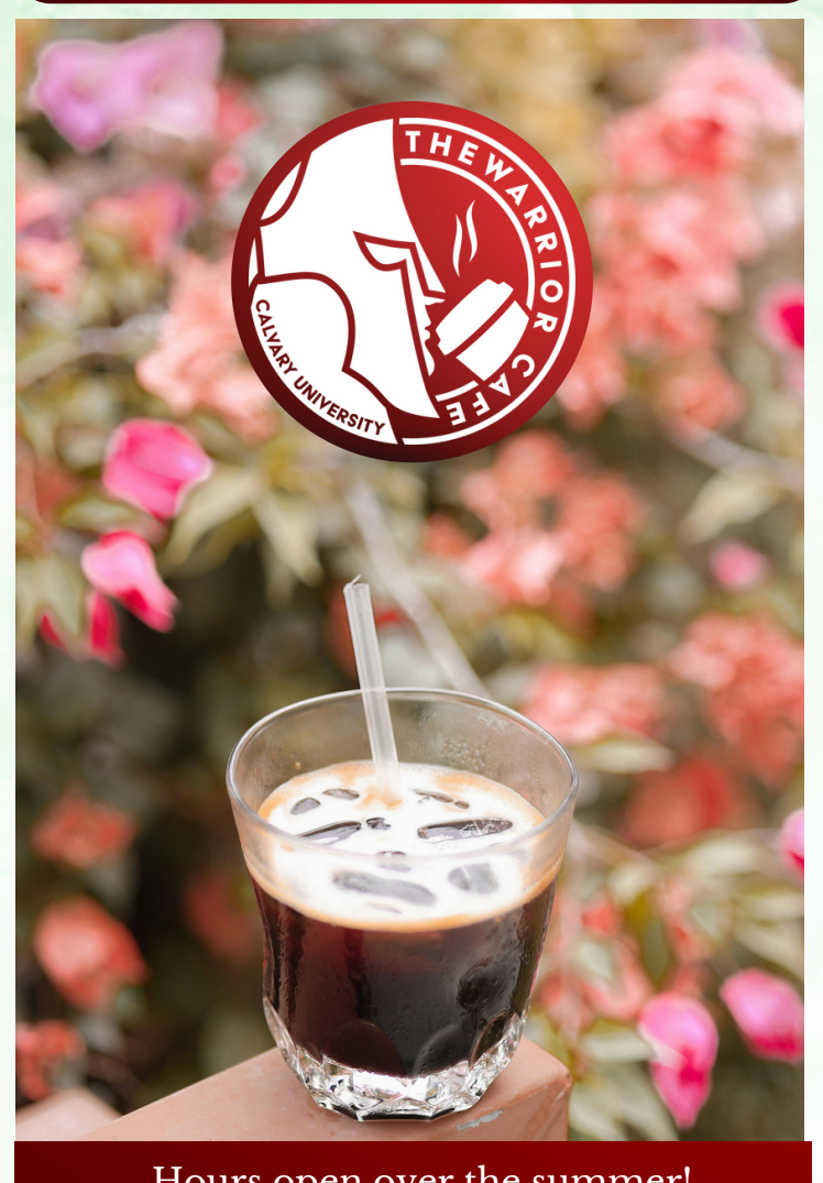
Hours open over the summer!

"Fear not, for I am with you; be not dismayed, for I am your God. I will strengthen you, Yes, I will help you, I will uphold you with My righteous right hand."