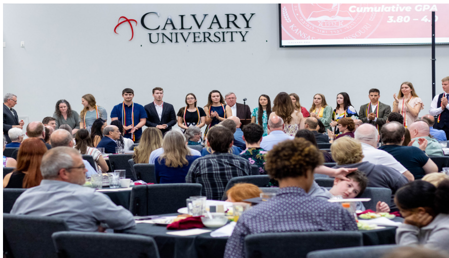
Alumni Induction Dinner 2024